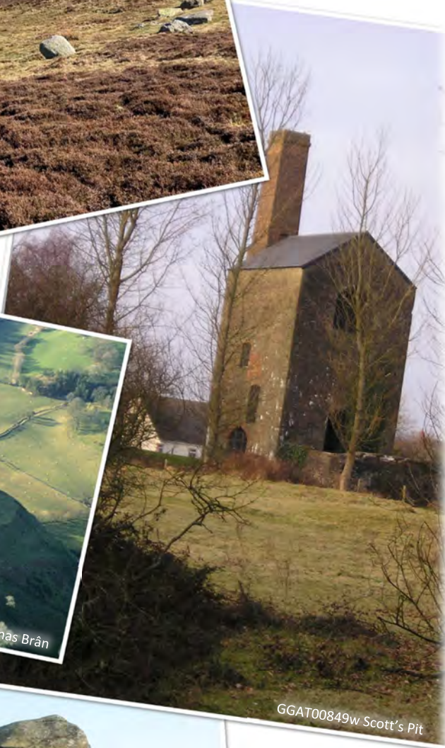
GGAT00849w Scott's Pit