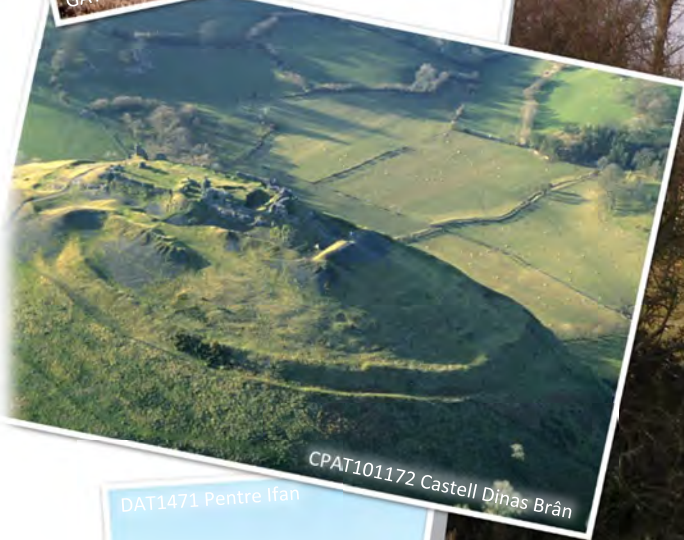
CPAT101172 Castell Dinas Brân