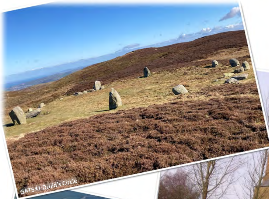
GAT541 Druid's Circle