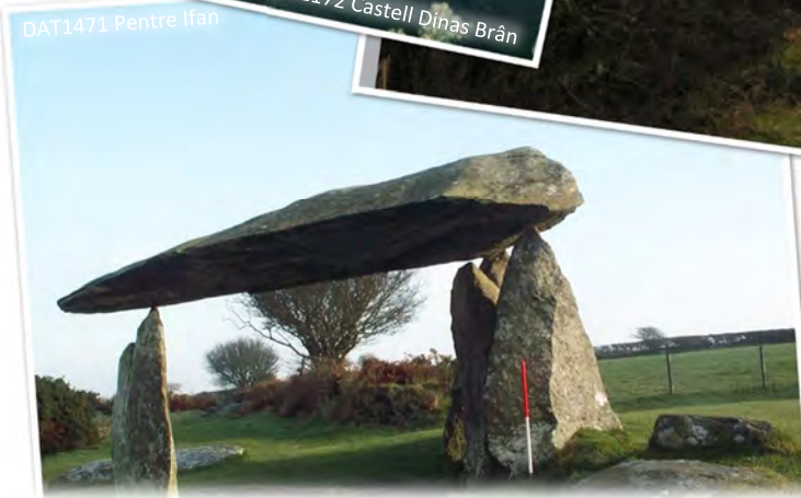
DAT1471 Pentre Ifan